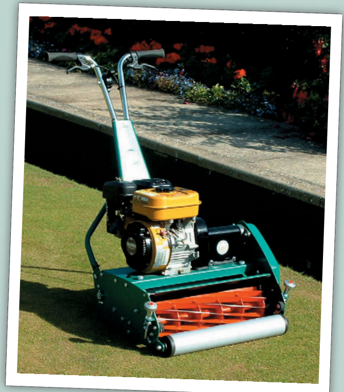
Model shown: 510G 20-inch Greensmower. Model 630G 25-inch is also available